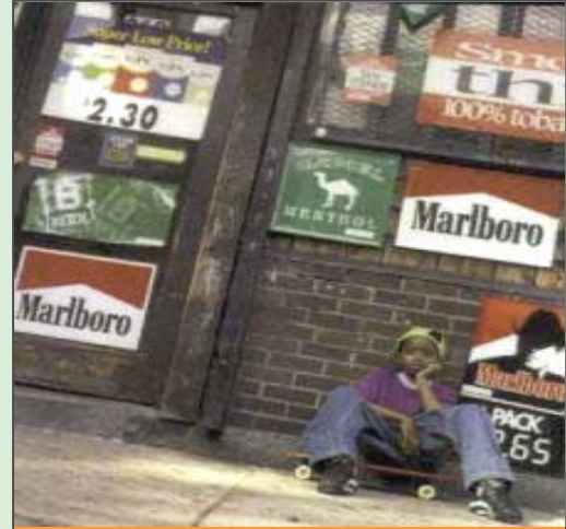
Inner-city youth are targeted by menthol tobacco advertising.